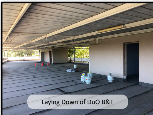
Laying Down of DuO B&T