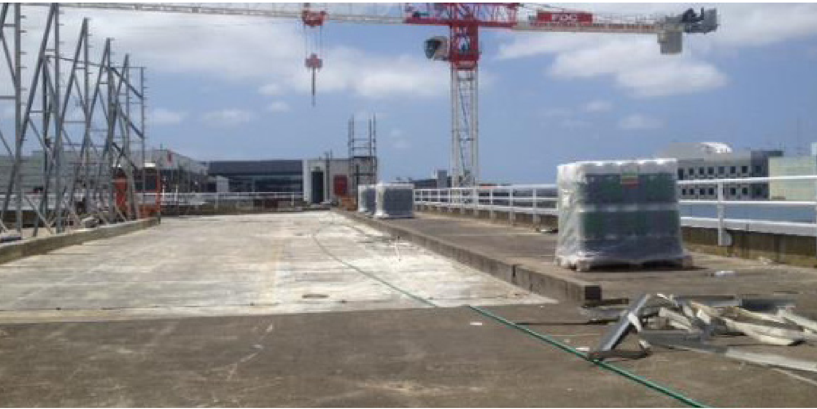
Prior to commencement