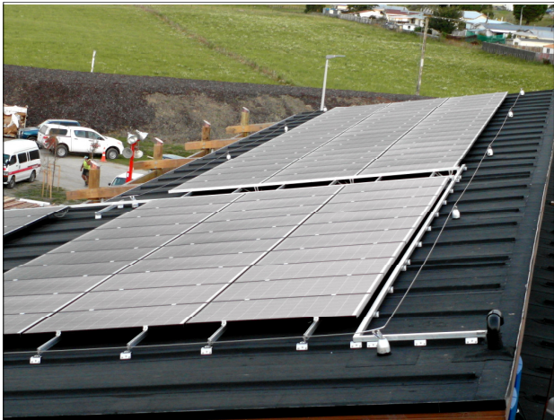
Completed with solar panels