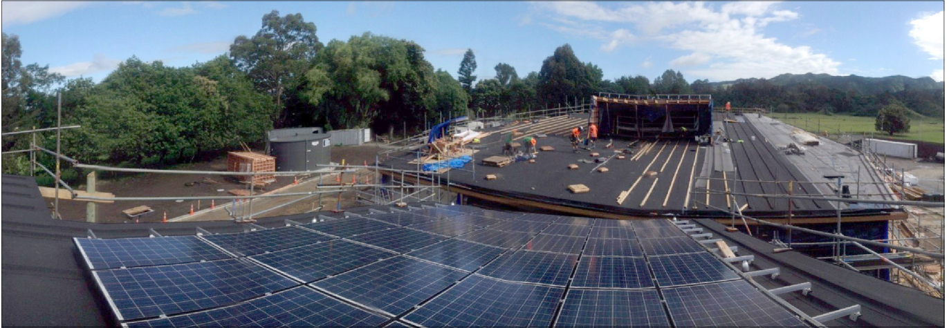
View showing several different stages of construction

Aotearoa's First Living Building Challenge Project