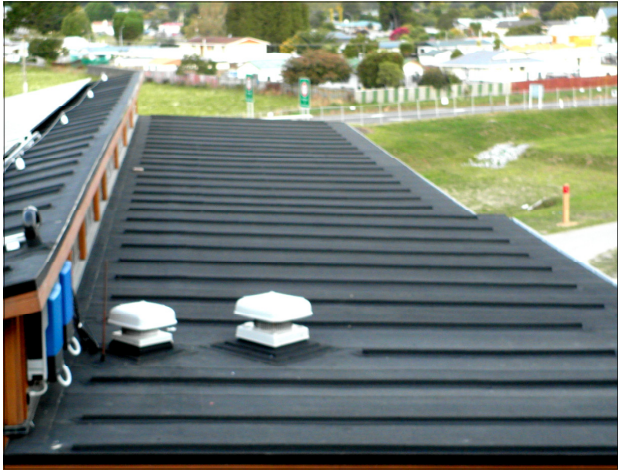
Completed kitchen and offices