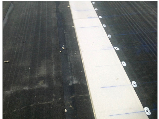
Vapour barrier, PIR board, mechanically fastened basesheet