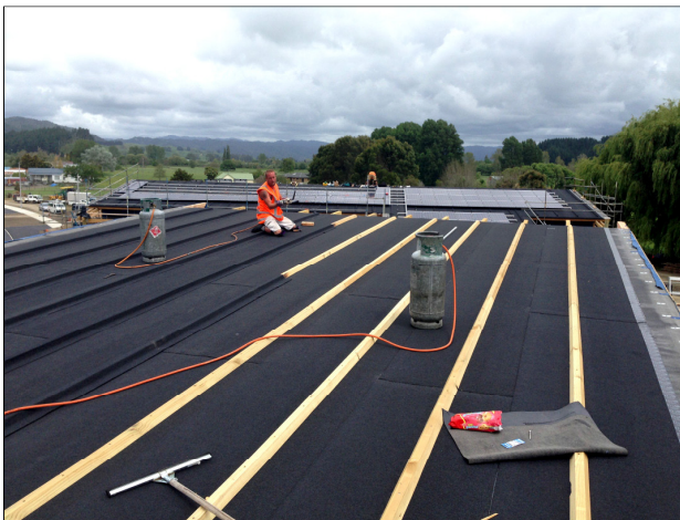
Capsheet and batten installation