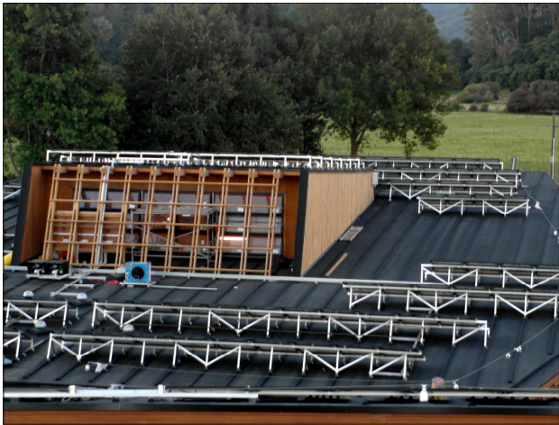
Main building completed roof