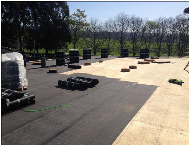
Vapour barrier and plywood substrate