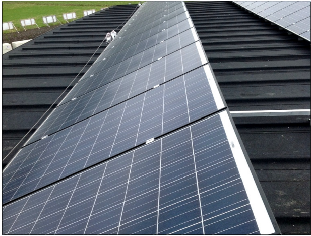
Completed with solar panels