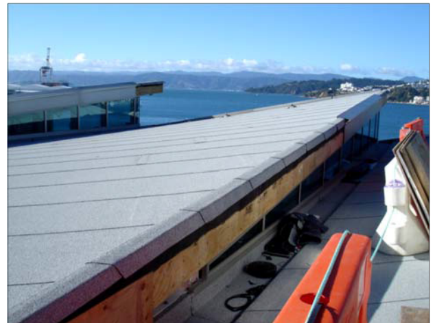
De Boer DuO capsheet