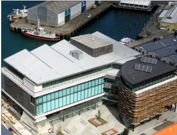
Completed Kumutoto Building