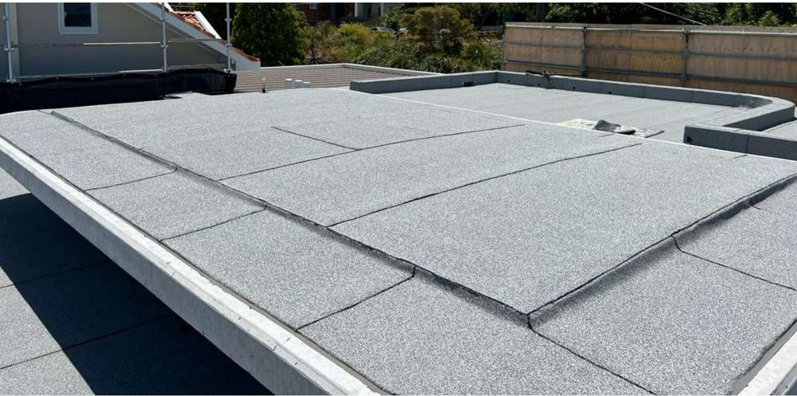
Waterproofing Membrane installed