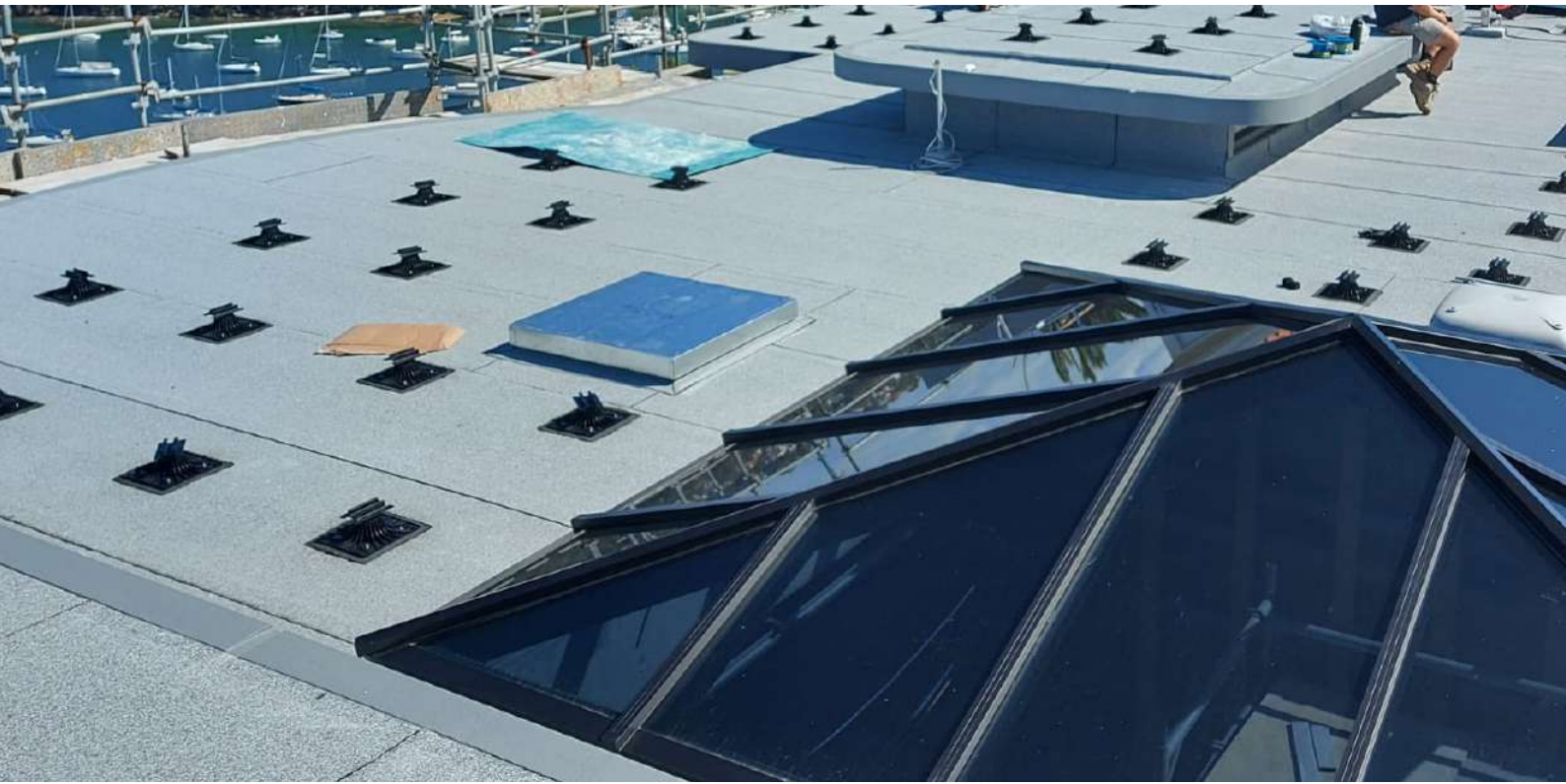
Pedestals on Roof