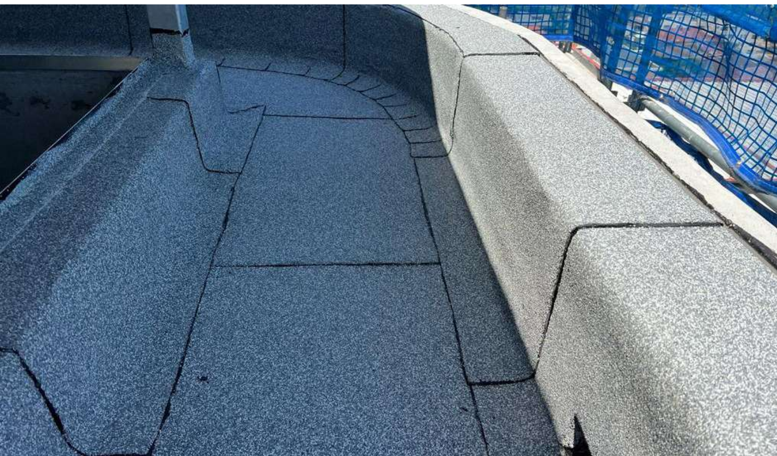
Waterproofing Membrane installed