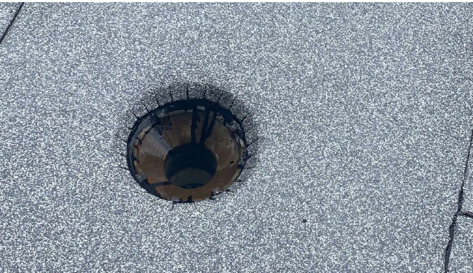
Cap Sheet Installation