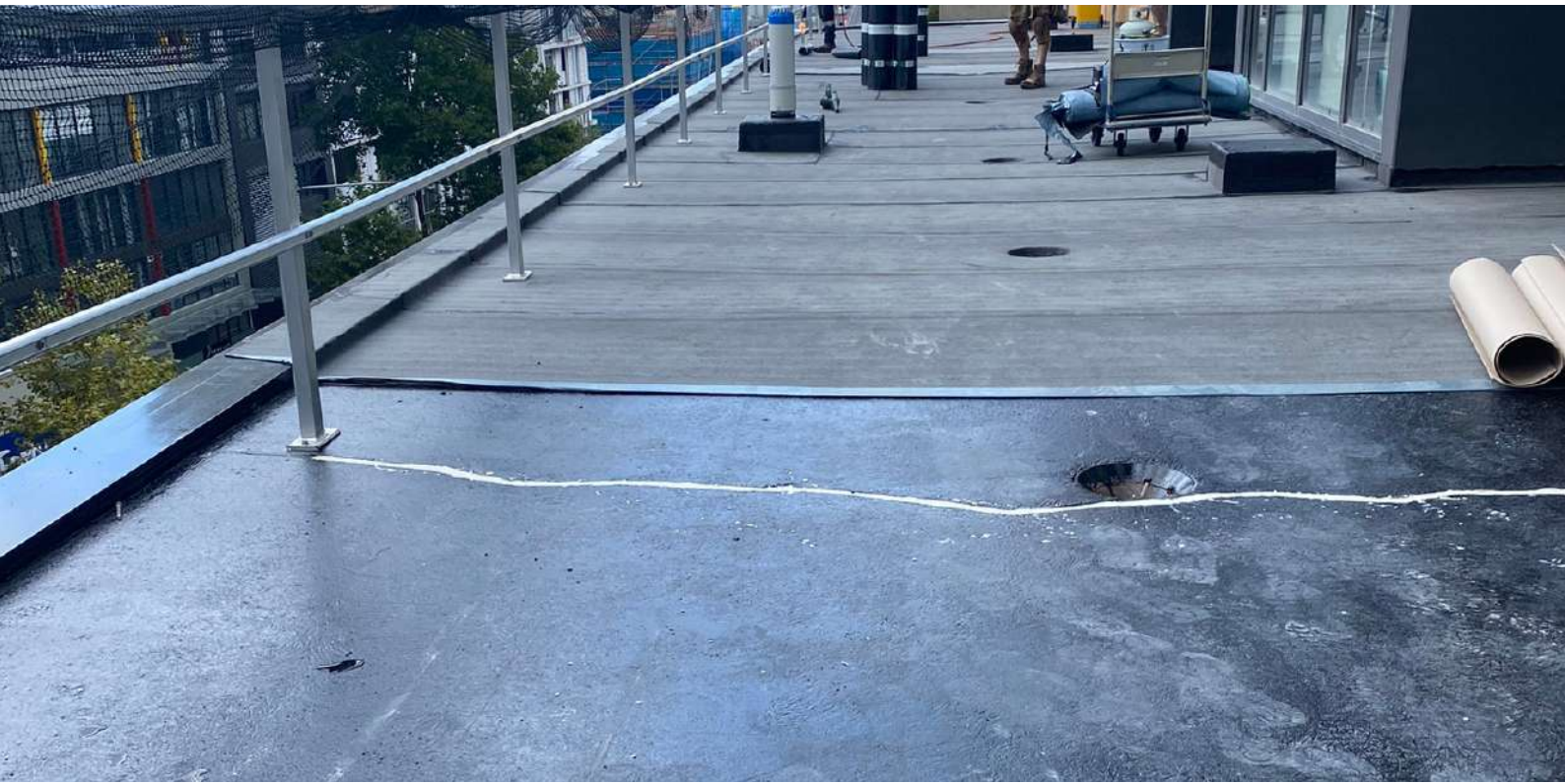
Base Sheet Installation