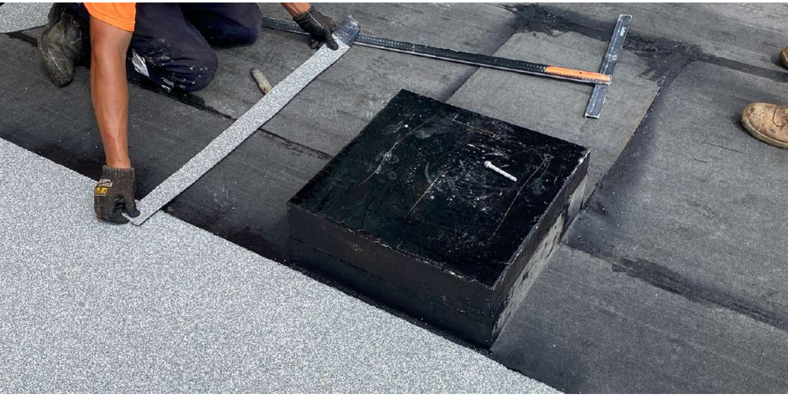
Cap Sheet Installation