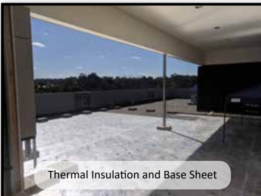
Thermal Insulation and Base Sheet