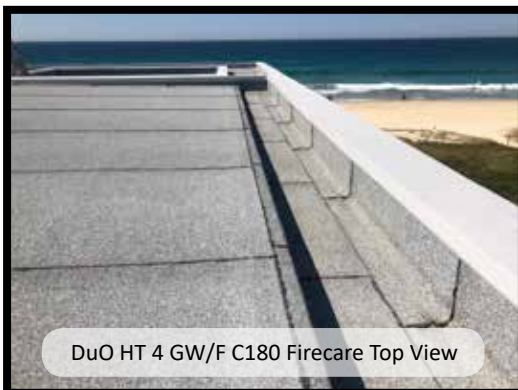
DuO HT 4 GW/F C180 Firecare Top View