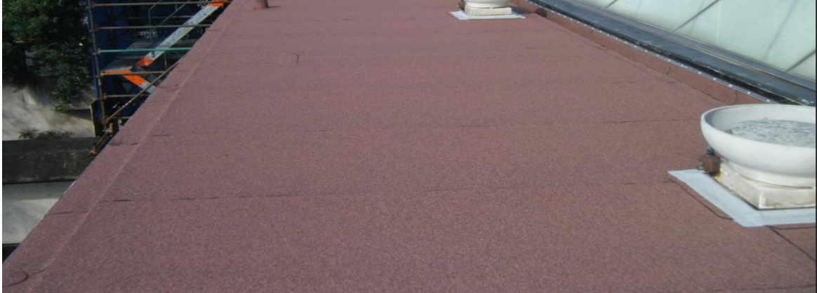
Roof renovated with DuO waterproofing membrane