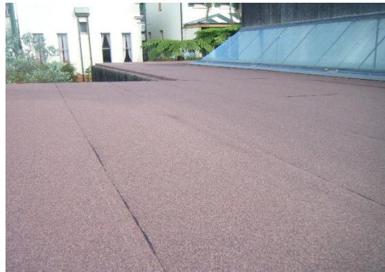
Renovated roof with skylight