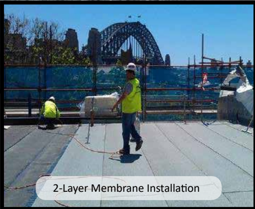
2-Layer Membrane Installation